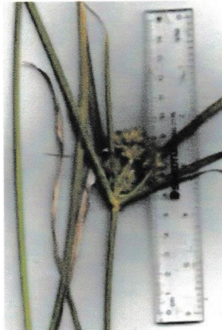
Family: CYPERACEAE Cyperus eragrostis : Umbrella Sedge Exotic herb ☼